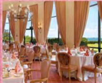
Windows On The Sound